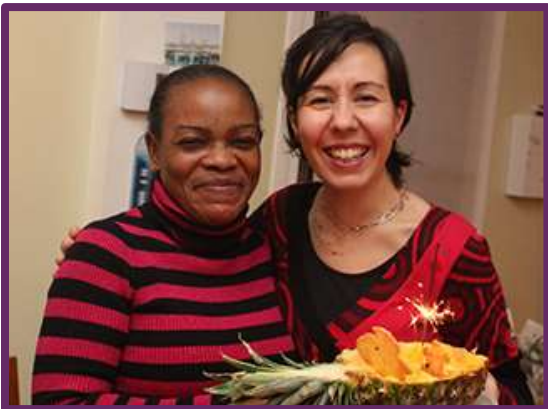
Action Réfugiés Montréal's "Twinning Program"

Hamilton Urban Core Community Health Centre donations- Donations of toiletries and non-perishable snacks and foods would still be of great help to the HUC CHC. Please leave your items in the boxes on the St. Andrew's stage. The HUC CHC staff will retrieve and replenish their supplies as they are given each week. Our community so appreciates your continued generosity. Thank you!